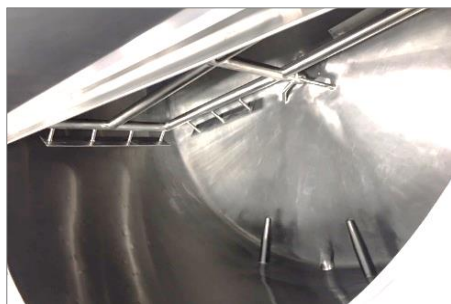
Full Sweep Agitation