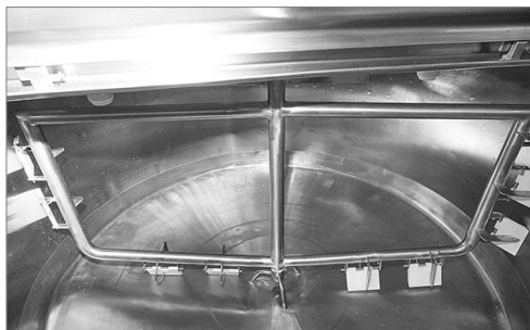
Full Scrape Agitation