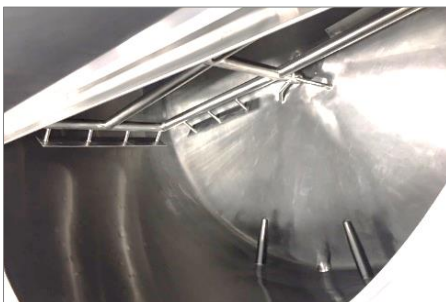
Full Sweep Agitation