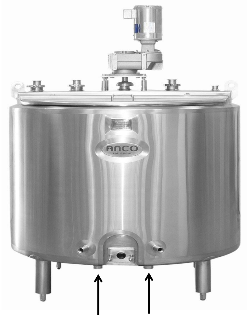
Bottom Jacket Ports These ports are interchangeable

Underneath the tank you will find two ports for the bottom zone or jacket. Connect your steam, water, or Glycol lines here. The ports are interchangeable so either port can be the inlet or the outlet. .