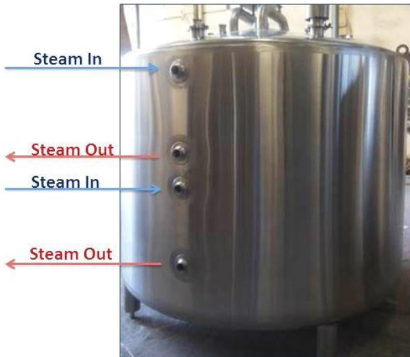
Bottom Ports are interchangeable.

Steam must always enter from the top inlet jacket and exit from the bottom or lower jacket port.