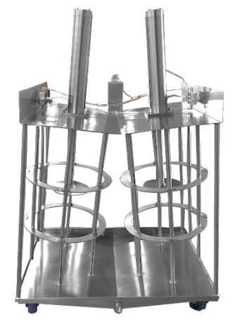
Cage Option For Round Molds

Please make notes and adjustment on the drawing or comment section below.