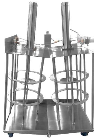
Cage Option For Round Molds