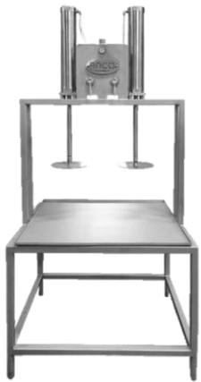
Table Top Design Option